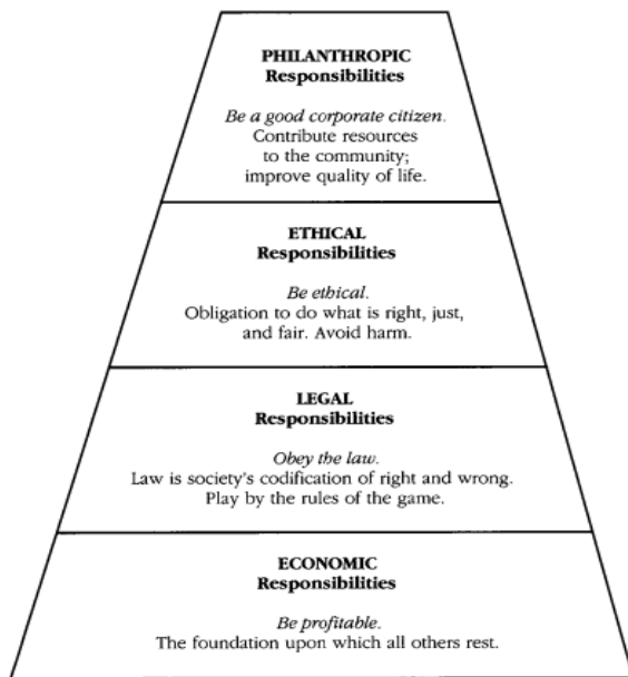
Fig. 2 The Pyramid Of Total Corporate Social Responsibility (Carroll, 1991a)

In Carroll's (1979) [5] and (1991a) [6] model/framework, he defines CSR as the ways organizations can meet the economic, legal, ethical, and discretionary needs/expectations of their stakeholders in society. Carroll (1998) [8] refers these as the four faces (components) of a corporate citizen, suggesting that organizations which can be considered socially responsible must meet society's needs as reflected through these four faces. Carroll (1991a) [6] later changed the 'discretionary' responsibility to 'philanthropic' responsibility. There has been support of the view that CSR is a contingent construct influenced by circumstances and the actors involved (Carroll, 1979) [5] and (Carroll, 1991a) [6].